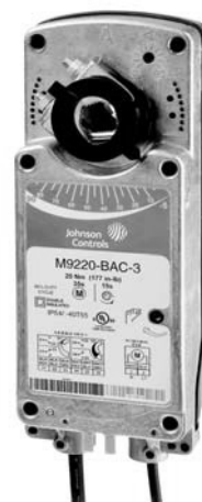
M9220 Series Electric Spring-Return Actuator